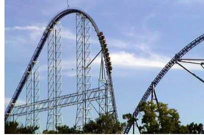
Millennium Force at Cedar Point